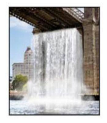
a showcase of science & society